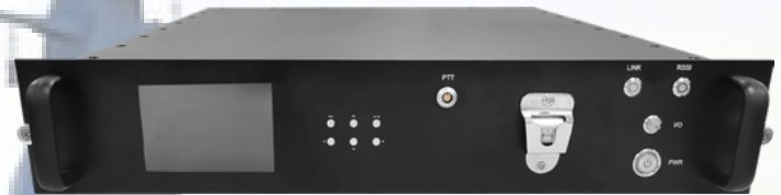
19" 2U Standard Rack With Display