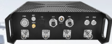
Four-band Selection Operate