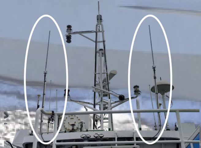
Application scenarios and Installation display