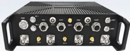
Dual-band Operation Simultaneously